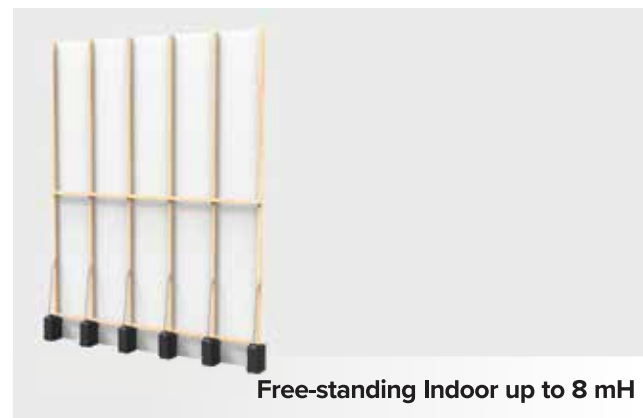
Free-standing Indoor up to 8 mH