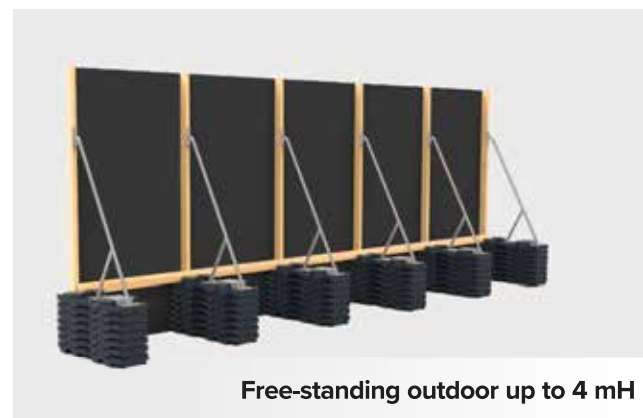
Free-standing outdoor up to 4 mH