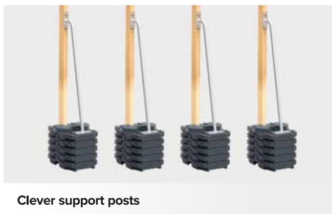
Clever support posts