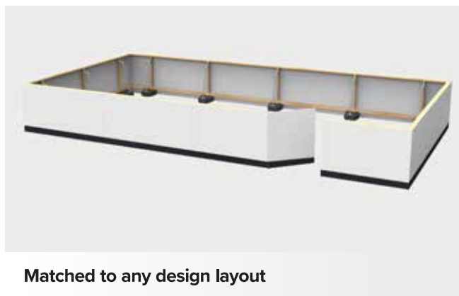
Matched to any design layout