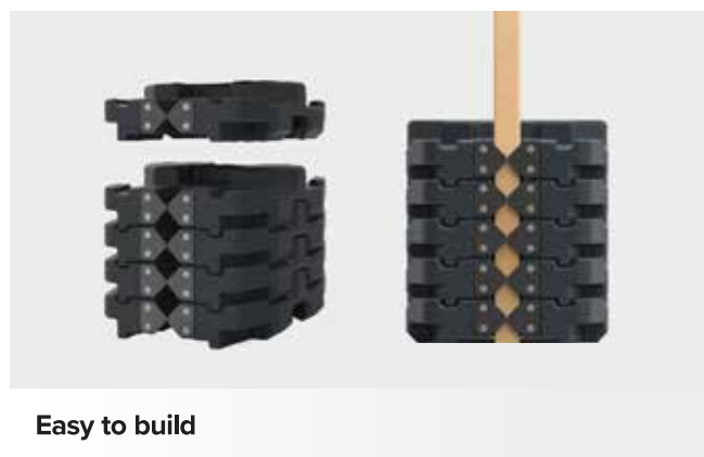
Easy to build