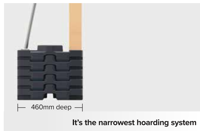
It's the narrowest hoarding system